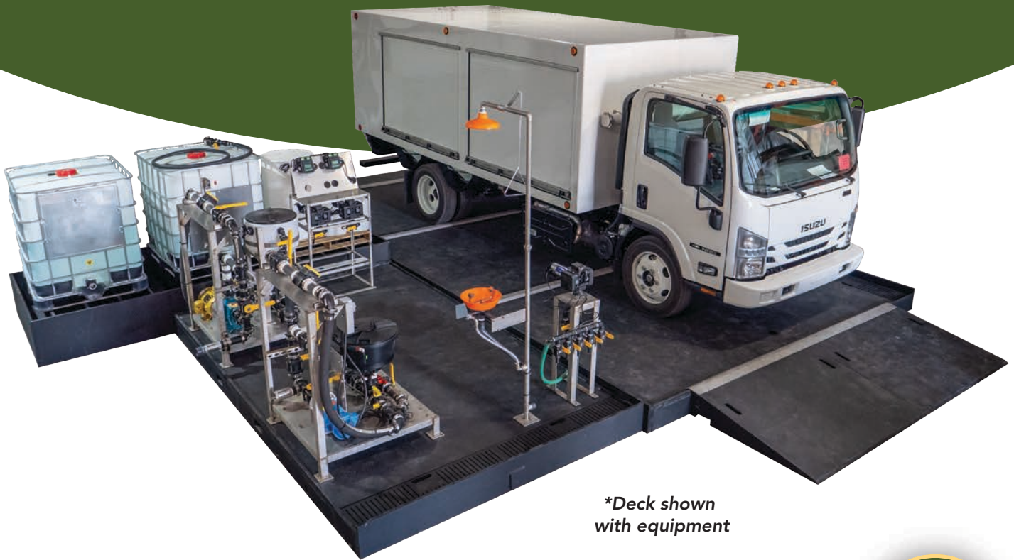
*Deck shown with equipment